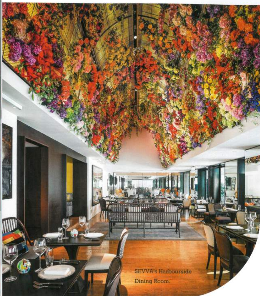
SEVVA's Harbourside Dining Room.