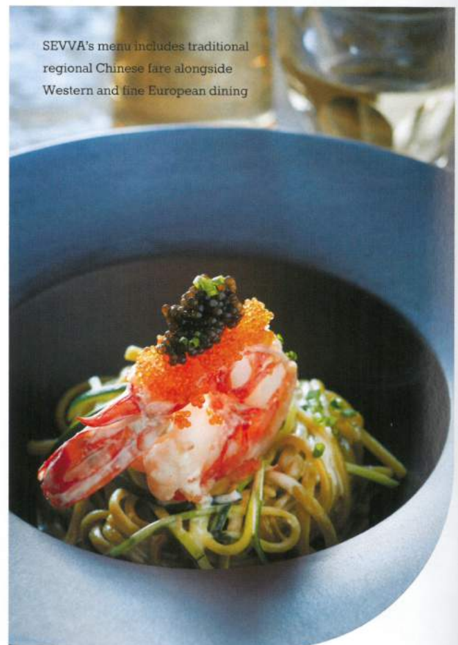
SEVVA's menu includes traditional regional Chinese fare alongside Western and fine European dining

"I had a good friend in Thailand who owned high-end supermarkets there. I was going to open a chain of chicken [restaurants], but I was headhunted by Chanel. At first I thought 'no way', but I met the then president of the company, who was Venezuelan and charming. He met me at the airport