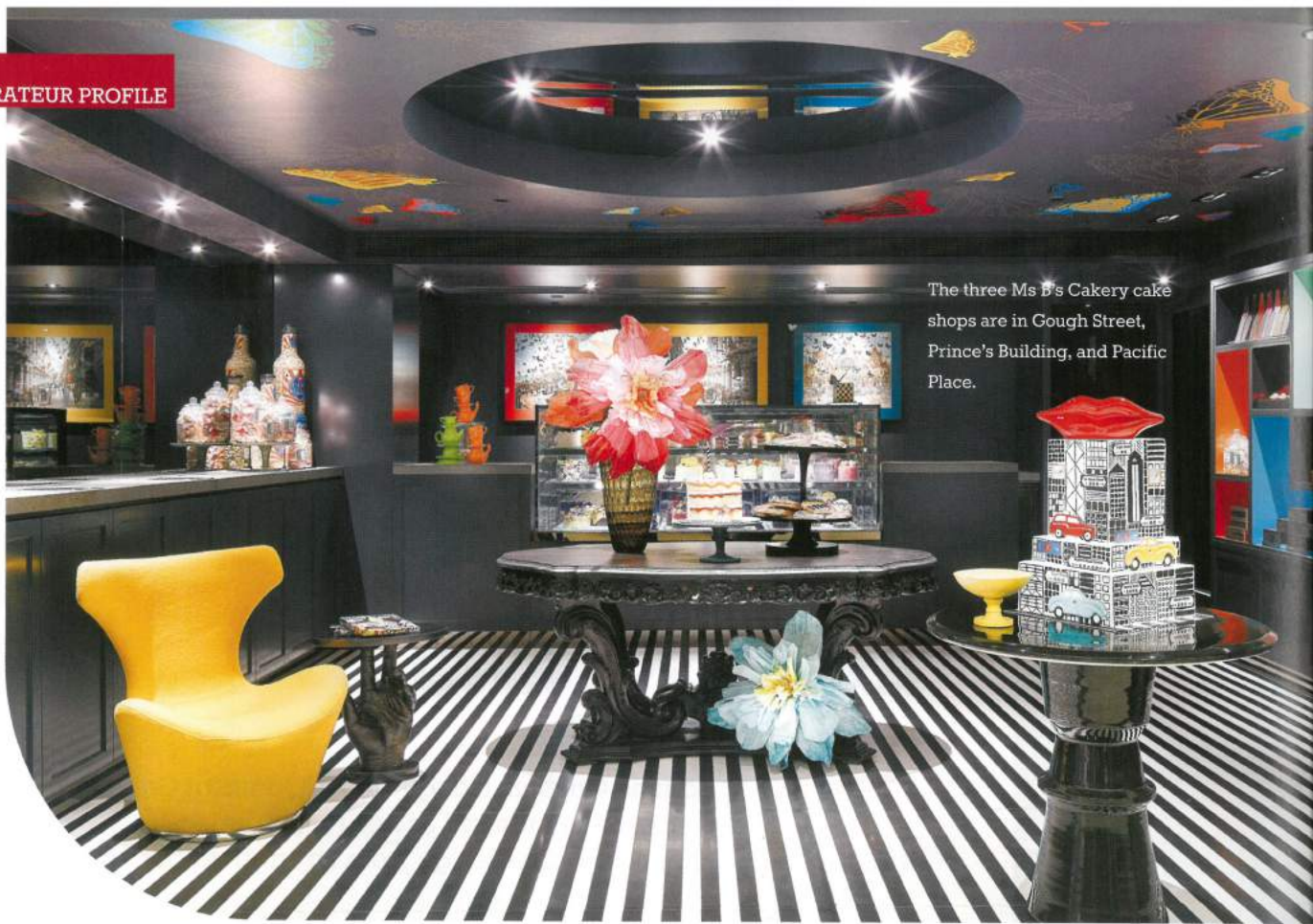
The three Ms B's Cakery cake shops are in Gough Street, Prince's Building, and Pacific Place.